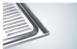
# SIT ON (TRIPLE BENDING)