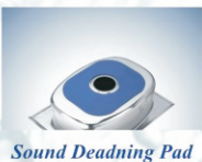
Sound Deadening Pad

A unique sound suppression pad, on all JINDAL models, helps minimize the noise of utensil washing and stacking on the sink.